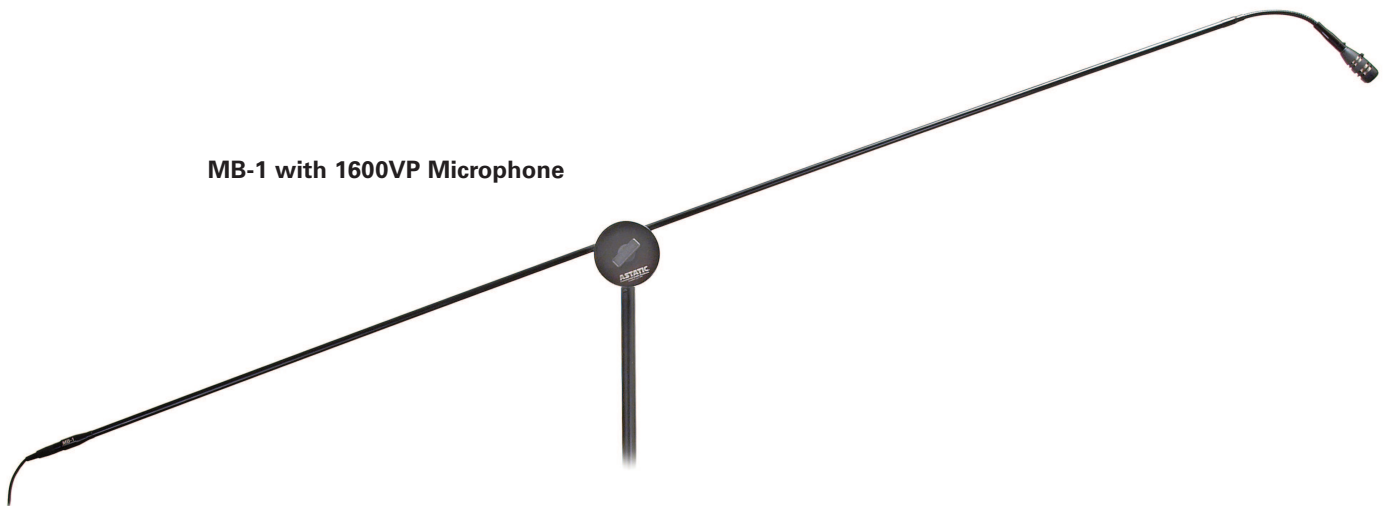
MB-1 with 1600VP Microphone